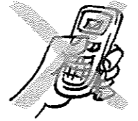
5 _____ text messages.