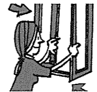
3 _____ the window.