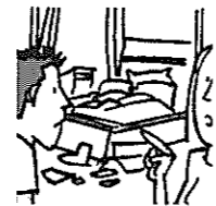
2 _____ your room.